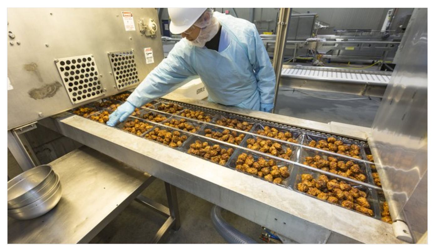
A SugarCreek production line.

"It's commonly known that access to quality, affordable childcare is a barrier to work for many," Holbrook said. "SugarCreek seeks to provide benefits and support to retain its current employees and attract future applicants."