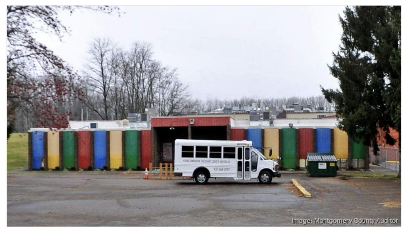
A photo of the building at 4257 Hoover Ave. in 2018.

"Sugar Creek has a childcare model which has been successfully implemented at a number of its other facilities whereby it provides the childcare facility, furnishes and maintains the building for a licensed childcare provider to operate in," the company said in the application. "The provider can focus on childcare at affordable rates without the burden of the building costs."